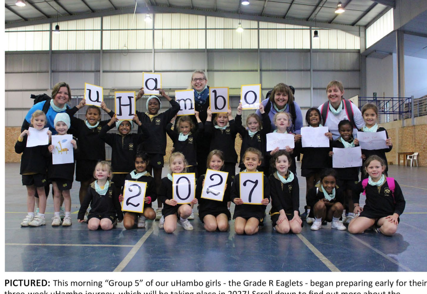
PICTURED: This morning "Group 5" of our uHambo girls - the Grade R Eaglets - began preparing early for their three-week uHambo journey, which will be taking place in 2027! Scroll down to find out more about the activities that our "Group 5" girls enjoyed this morning as they trekked around the school!